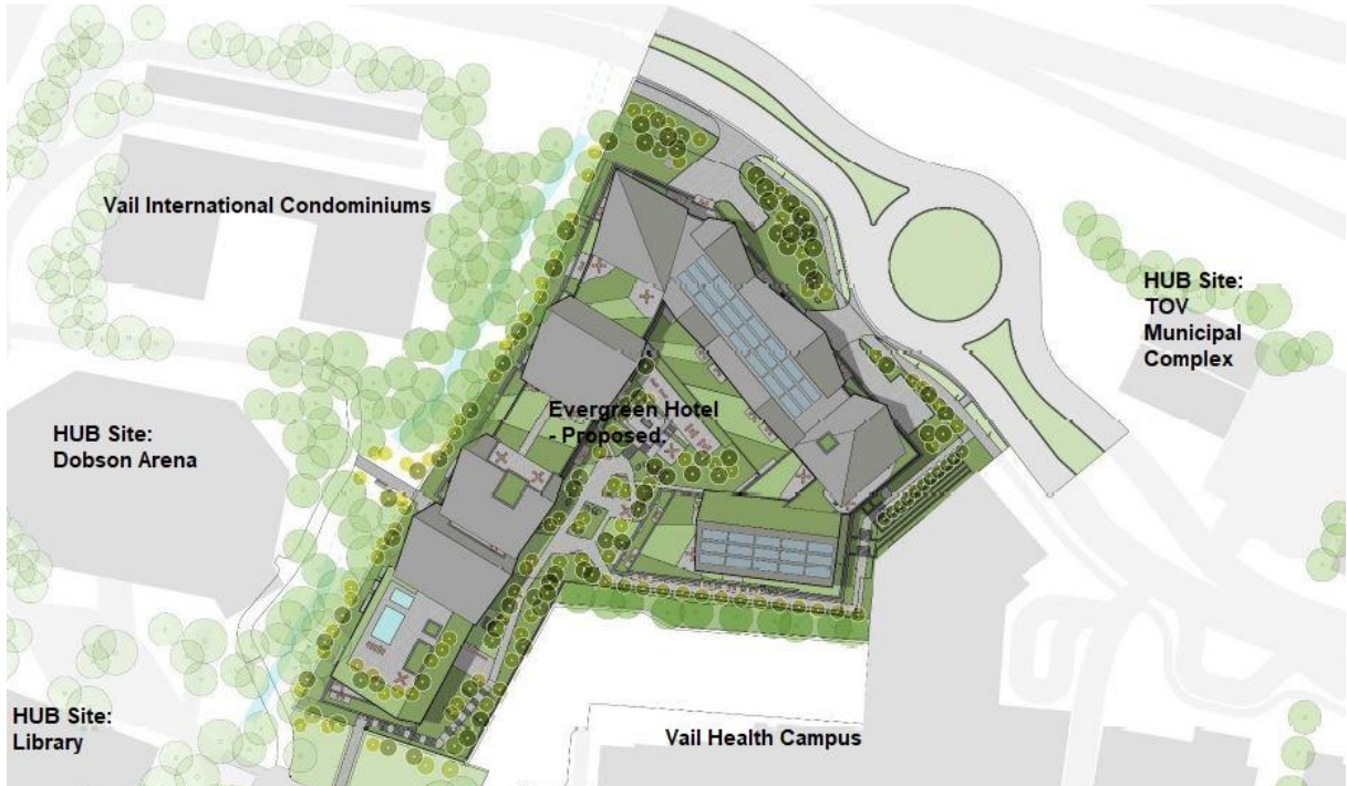
The proposed Evergreen is central to Vail Health Campus and TOV HUB sites.