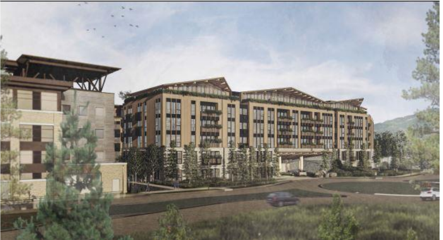
View of proposed Evergreen Building from South Frontage Road. Hospital parking structure with helipad on the left.

Vail Council will hear the Evergreen Hotel appeal on the 3 rd of January.