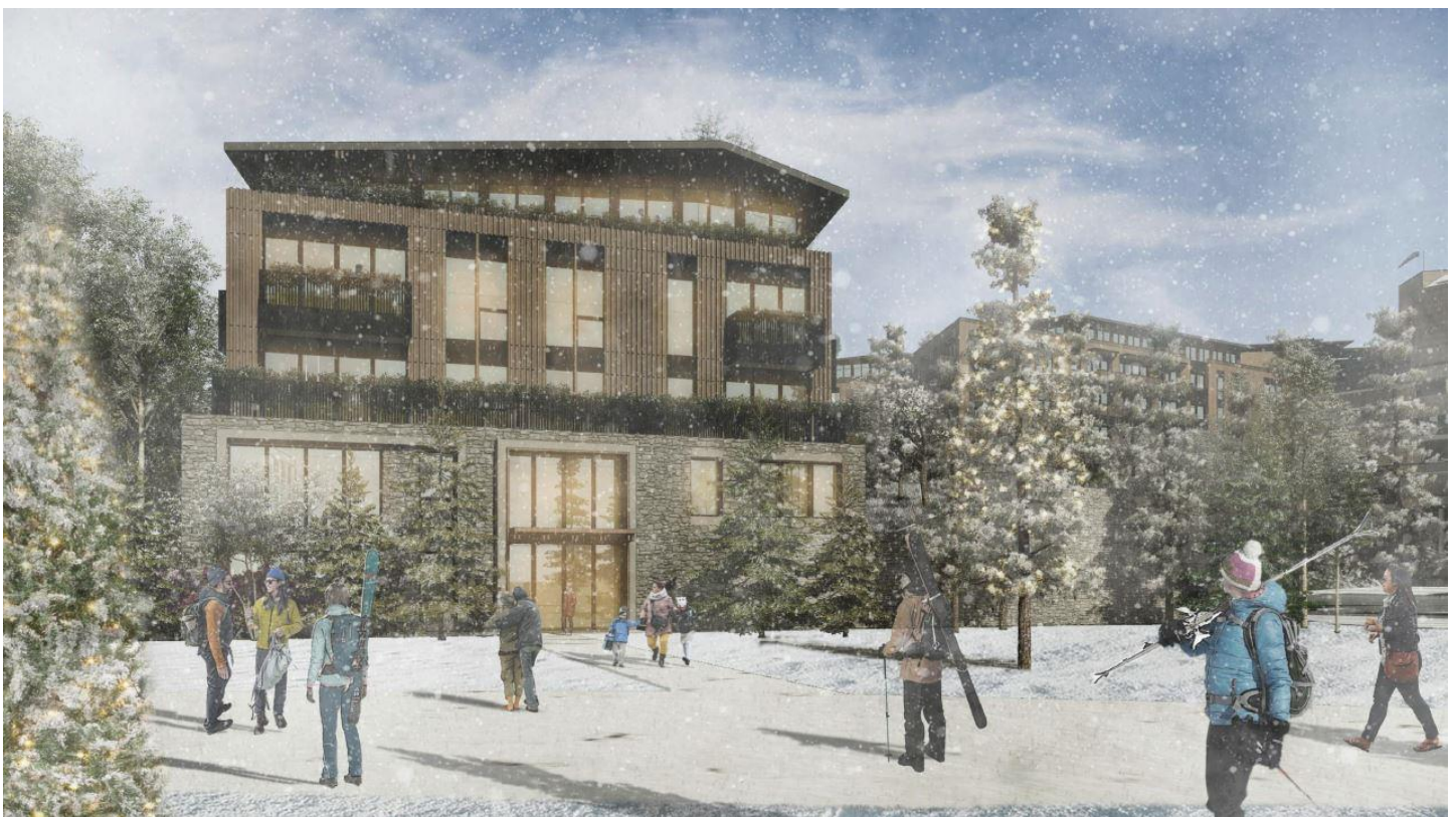
Evergreen Hotel from West Meadow Drive.

Now new owners, the Solaris Group, have proposed another plan for re-development of the property. It proposes the complete demolition of the existing Evergreen Lodge, to be replaced with a new multi-family residential dwelling building with accommodation units.